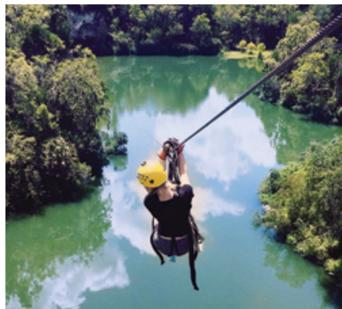
The Canyons Zip Line and Canopy Tours, Ocala, Florida